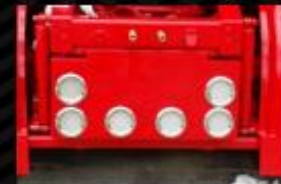
RB-002 15"X34" $500 RB-003 20"X34" $500