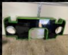
379 Firewall Cover Up to 2004 $1200