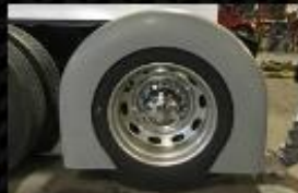
SF-PROJECT ONE or TWO STYLE $795