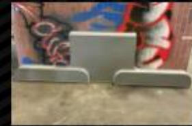
T-SS-005 Available top mount and bottom mount