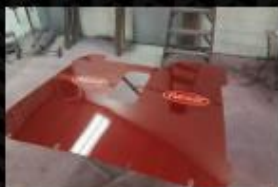
Peterbilt Floor $450