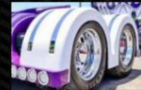
DF-SS $1300 with stainless $1530