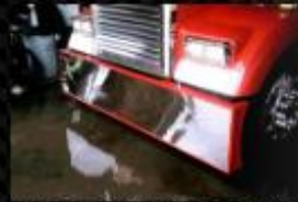
22-SS-FB MEDIUM SIDE without stainless $650 with stainless $940