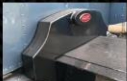
Shock Box Cover SB-001 $400