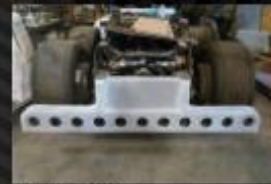
T-SS-003 Available top mount and bottom mount