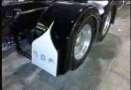
DF-D-LB1 OR DF-D-LB2 $1300 (Light boxes on one or both ends)