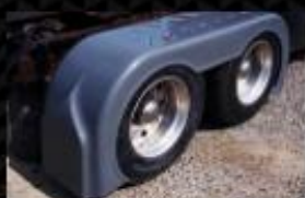
FF-ELITE with light box $1200