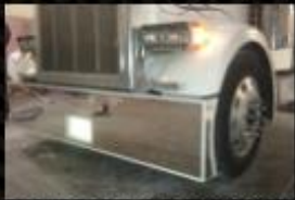
20-SS-FB MEDIUM SIDE without stainless $650 with stainless $940