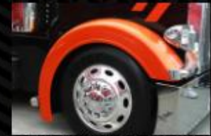
CUSTOM LONG SIDE 379 & 389 (99" length) $795