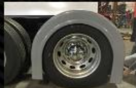
SF-5.5 38" $795