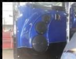
Door Panels $500 DP-PETE-001