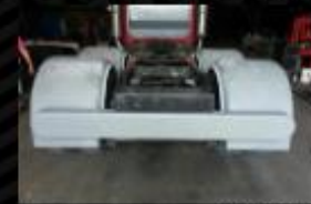
LB-001 without stainless $500 with stainless $790