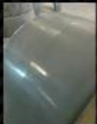
SF-5.5 38" with rib $795