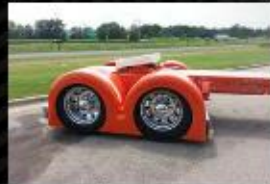
DF-PROJECT ONE $1300