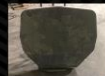
FWC-PLAIN FONTAINE $265