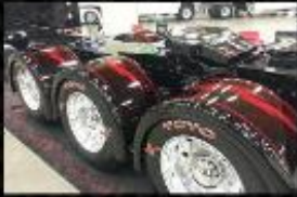
SF-3.5 30" $795 (30" No shelf)

All prices are per set of two. Fenders can be cut to any length.