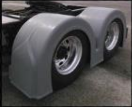
DF-LB1-007 OR DF-LB2-007 $1300 (Light boxes on one or both ends)