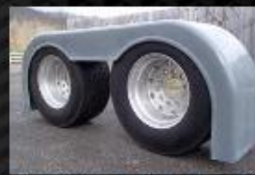
FF-SUPER SINGLE $1200