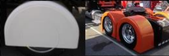
SF-X Custom Cut (Sent Solid) $795