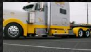
CP-1-379 & 389-Glider PSP-1 $375 per set of two