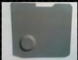
Door Panels $400 DP-KW-001

Pete CP1-379-Full Cab Panels available in 6", 9", and 11" drop. Pete CP1-389-Glider-Full Cab Panels available in 6" and 9" drop. Sleeper Panels PSP-1 available in 36", 48", 63", and 70" lengths.