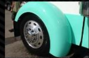
CUSTOM OLD SKOOL 379 $795