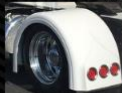
SF-LB-1 3.5 30" with light box $795 (30" No shelf)