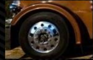
CUSTOM SHORT SIDE 379 (91" or 99" length) $795 389 (99" length) $795