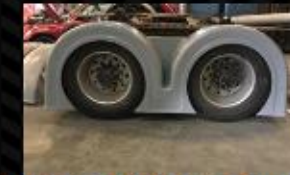
DF-SUPER SINGLE $1300

All prices are per set of two. Stainless is additional charge. Fenders can be cut to any length.