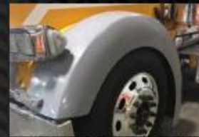
CUSTOM PROJECT ONE 379 & 389 $795