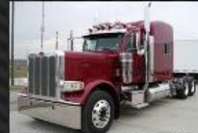
STOCK REPLACEMENT 379 & 389 $550