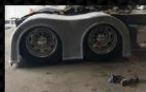
FF-SLO RIDE $1200