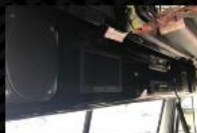
Pete & KW Overhead Consoles $400

Pete CP4-379-Full Cab Panels available in 9" drop. Sleeper Panels PSP-4 available in 36", 48", 63", and 70" lengths.