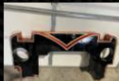
379 Firewall Cover 2005 and newer $1200