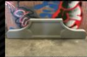
T-SS-004 Available bottom mount

T-bars without stainless $650 with stainless $940