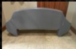
Shock Box Cover SB-002 $400

Pete CP1-379-Full Cab Panels available in 6", 9", and 11" drop. Pete CP1-389-Glider-Full Cab Panels available in 6" and 9" drop. Sleeper Panels PSP-1 available in 36", 48", 63", and 70" lengths.