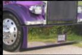
20 & 22-SS-FB LONG SIDE without stainless $650 with stainless $940