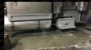
CP-4-379 PSP-4 $375 per set of two