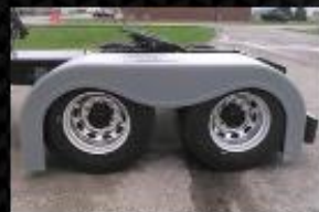
FF-S LONG $1200

Only Bad Ass Customs has Dual Guard Liners. The strongest liner system on the market today. With a built in hidden track system that fits the competition's A22! Guaranteed!