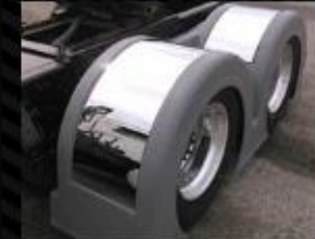
DF-SS-WIDE $1300 with stainless $1890