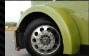
CUSTOM MEDIUM SIDE 379 (91" or 99" length) $795 389 (99" length) $795