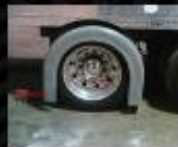
22.5 super lo pro or 19.5 SF $795