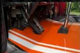
Kenworth Floor $450