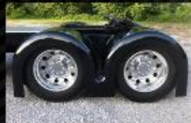
DF-PROJECT TWO $1300