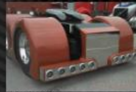
T-SS-001 Available top mount and bottom mount

T-bars without stainless $650 with stainless $940