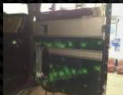
Doors Panels $300 DP-PETE-FLAT

Pete CP4-379-Full Cab Panels available in 9" drop. Sleeper Panels PSP-4 available in 36", 48", 63", and 70" lengths.