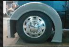
CUSTOM BAILEY 379 $795