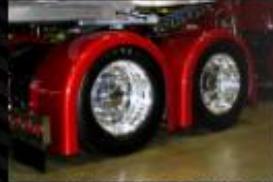
SF-3.5 38" $795

All prices are per set of two. Fenders can be cut to any length.