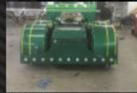
T-SS-002 Available bottom mount