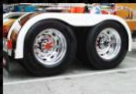
FF-S $1100 (30" No shelf)